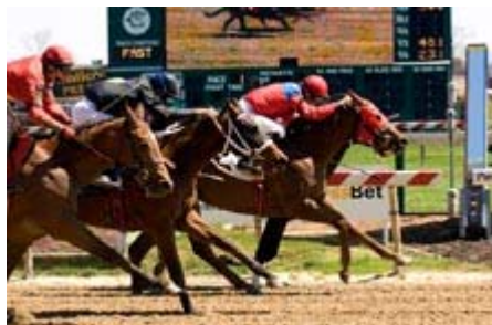
Snow Storm Lady