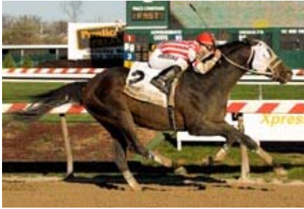
Private Scandal