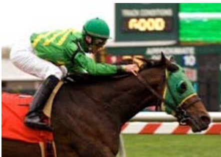
Stay Close