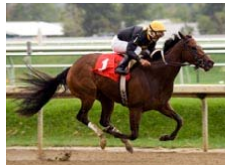
Your Flame In Me

Southwestern Heat, the first foal of champion filly Xtra Heat, is the 4-5 favorite in the race immediately following the race named for his mother. The three-year-old broke his maiden in impressive fashion at Laurel Park earlier this month and is using the 5-furlong test on the turf as a prep for the $100,000 Hirsch Jacobs Stakes on the Preakness undercard in three weeks.