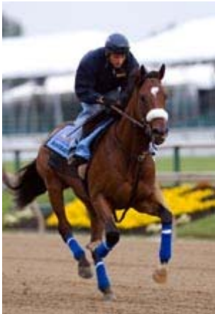
Barbaro Gallops