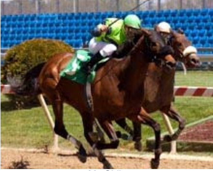
My Girlie

BALTIMORE, 04-21-07 ---Runaway Point Farm's My Girlie sped to the front from her outside post, set pedestrian fractions and while drifting out towards the finish line, had enough left in the tank to hold off post time favorite Silmaril and win the $125,000 Northview Stallion Station Stakes for older fillies and mares, the first of five added money races today at Pimlico.