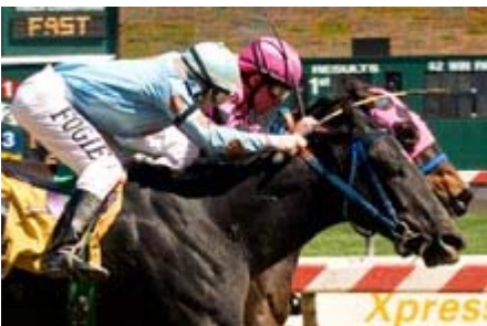
Heart Throbbin'

BALTIMORE, 04-21-07 ---One & Won Stable's Heart Throbbin' wore down the favorites to spring an upset in the $125,000 Maryland Stallion Station Stakes for 3-year-old Maryland-breds and Maryland Million nominees.