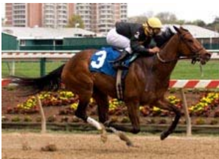
Your Flame In Me takes Xtra Heat Stakes