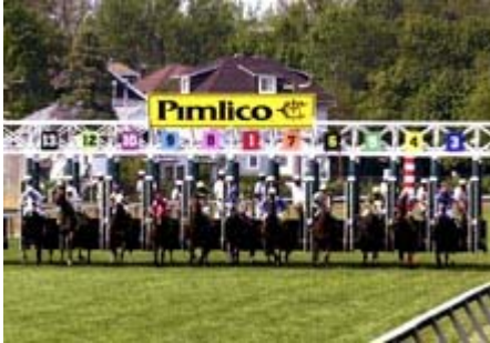
Pimlico Race Course

BALTIMORE, 04-12-07 ---Live racing shifts to historic Pimlico Race Course next Thursday for the spring meeting. The headline event of the eight-week stand is the 132nd running of the $1 million Preakness Stakes® (Grade I), the middle jewel of the Triple Crown, on May 19.