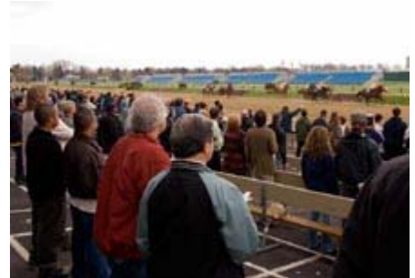
Fans enjoying opening day at Pimlico

More than 5,253 fans turned out under cloudy skies to enjoy an afternoon at the historic Baltimore oval, which will feature live racing through Saturday, June 9. The signature race of the stand is the 132nd Preakness® Stakes, the middle jewel of the famed Triple Crown 30 days from today, Saturday, May 19.