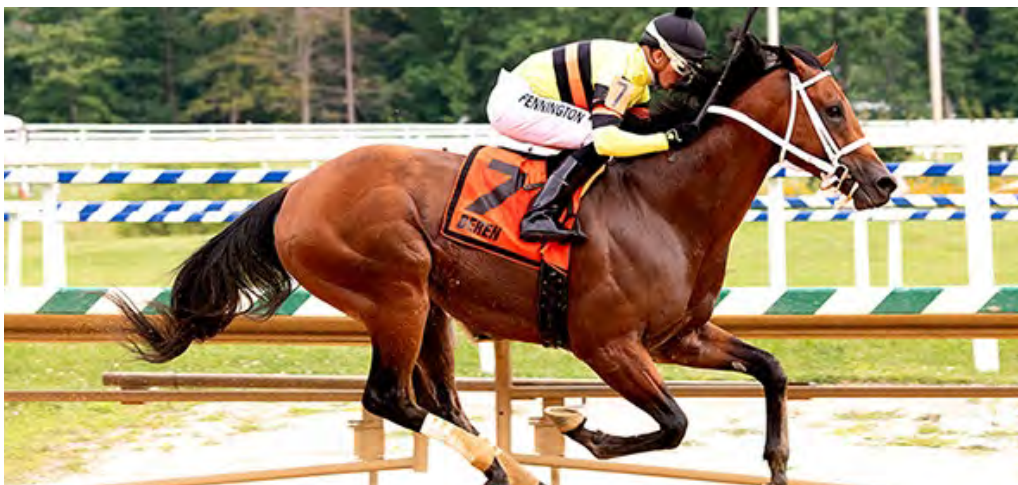
2022 De Francis Dash winner Beren.

The Frank J. De Francis Memorial Dash is one of the elite sprints in the country.