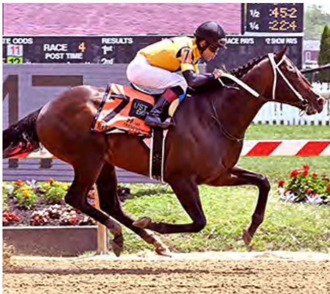
Jaxon Traveler winning the 2022 Maryland Sprint Stakes.

Distance 7 furlongs in 1987. Run at Laurel in 1987. First graded in 1994. Run as a handicap prior to 2015. Not run in 2020.