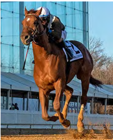
Fan favorite Cordmaker scored his first graded triumph in the 2022 General George.

The race was first Graded in 1991 and now joins the Barbara Fritchie (G3) to complete the Winter SprintFest, which has become the highlight of Laurel Park's winter meet.