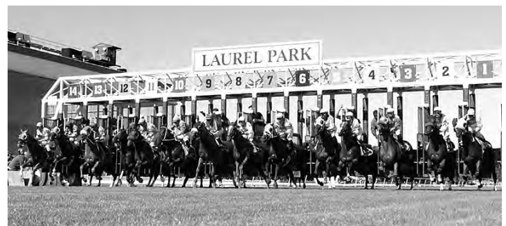
A full field breaks from the gate on September 8, 2005 for the first race on Laurel's newly renovated turf course.