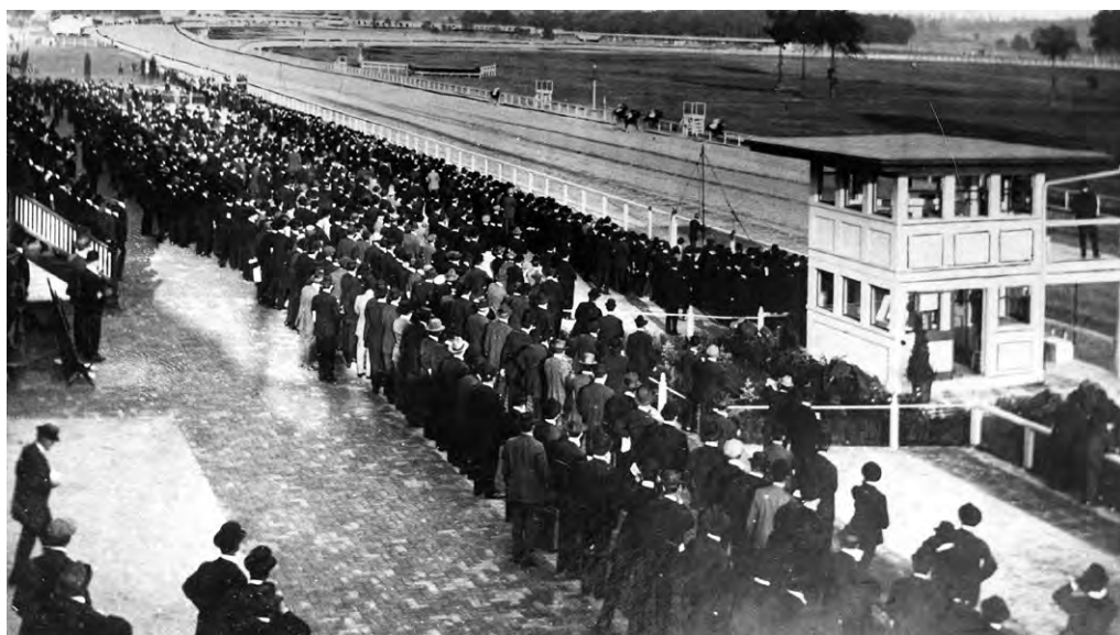
Laurel Park opened on October 2, 1911.

In 1986, another $1 million was spent on additional improvements. The first floor of the clubhouse was