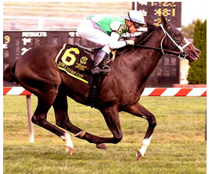
Set Piece winning the 2022 Baltimore-Washington International Turf Cup.

Not run in 2014 or 2020. Run as Colonial Turf Cup from 2005-13; Commonwealth Cup 2015; Commonwealth Turf Cup 2016. For 3-year-olds, 2005-2010. Grade 3, 2007-08, 2018-present; Grade 2, 2009-10, 2013-17. Contested at 1 3/16 miles 2005-13; 1 1/8 miles 2015; one mile 2016-present.