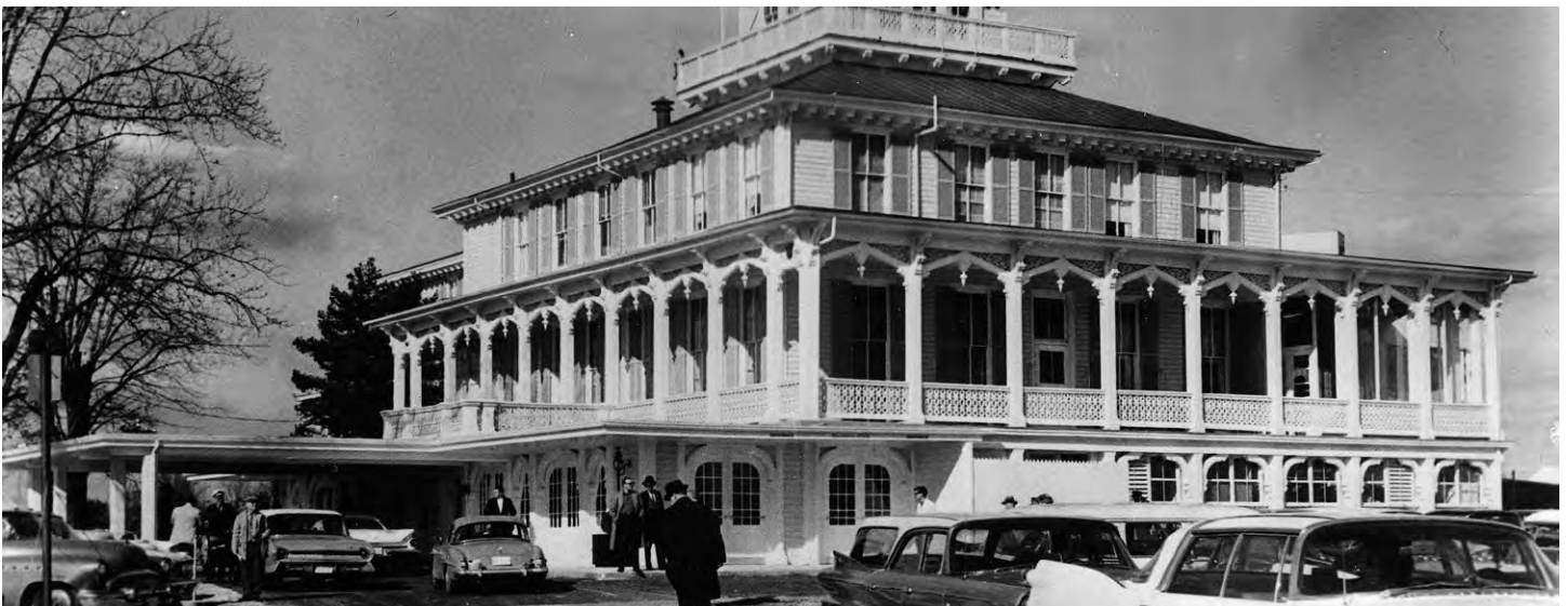
The Pimlico Members' Clubhouse circa 1959.