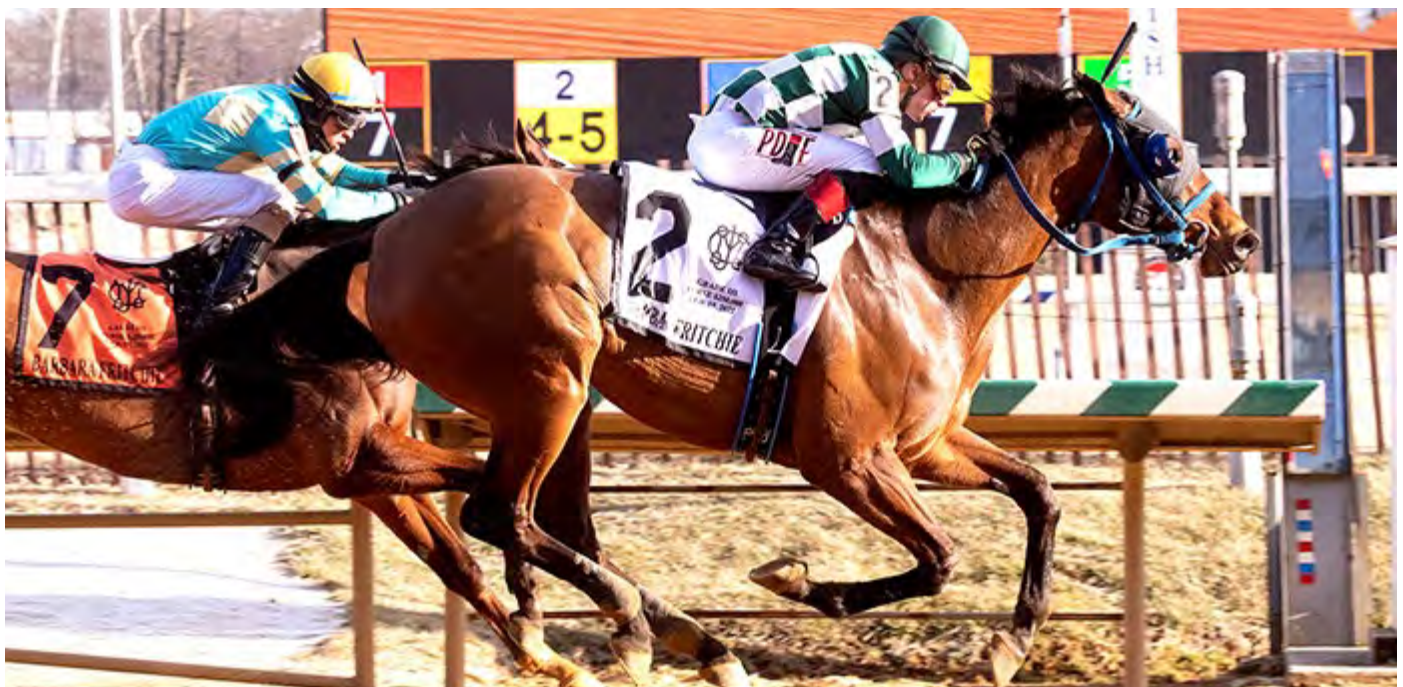
Glass Ceiling shipped in from New York to register a popular half-length victory in the 2022 Barbara Fritchie.

Not run in 1960, 1972 & 2006. Distance 1-1/16 miles from 1952-1954; 1 mile in 1961; 6 furlongs from 1957-1959 & 1963. Runa at Bowie Race Course prior to 1985. Grade 3 1973-1991; 2019-present; Grade 2 1992-2018. * New track record.