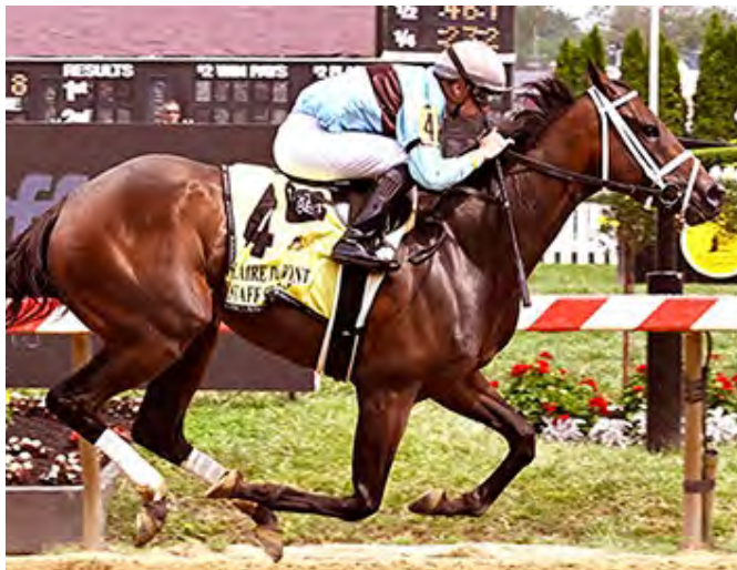
Super Quick winning the 2022 Allaire du Pont.

Run as Pimlico Distaff Handicap 1992-2001. Run as Pimlico Distaff Breeders' Cup Handicap 2002-2005. Distance 1-1/8 miles 1992-2001. First graded in 1994. Grade II 2007-2009. Not run 2010, 2014.