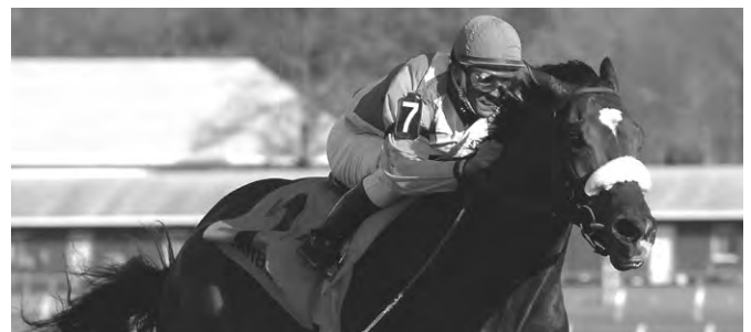
With his victory in the 2006 Kentucky Derby, Barbaro became the 16th Laurel Futurity winner to go on to capture a Triple Crown race at three.

Not run in 1933, 1934, 2001, 2008-2010. Distance 1 mile from 1921-1928; 7-1/2 furlongs in 1994 & 1995; 1-1/8 miles from 1996-2000; 1-1/16 miles from 2002-2007; 5-1/2 furlongs from 2012-2016. Run as Pimlico Futurity prior to 1967; as Pimlico-Laurel Futurity from 1967-1971. Run at Pimlico prior to 1967 and in 1979. Run on the main track 1921-1986, 1989, 1994-2004. Grade I 1973-1988; Grade II 1989; Grade III 1990-2004.