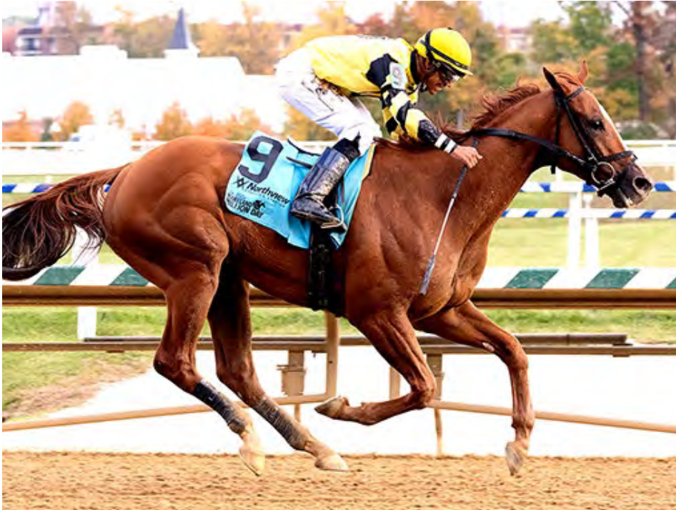
Ournationonparade wins the 2022 Maryland Million Classic.