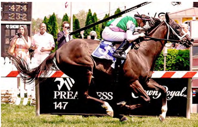
Set Piece winning the 2022 Dinner Party.

1 1/8 MILES. ( Turf ) ( 140 ) DINNER PARTY S. Grade II. Purse $250,000 FOR THREE-YEAR-OLDS AND UPWARD. By free subscription. $1,250 to pass the entry box, $1,250 to start, with $250,000 Guaranteed, of which 80% to the winner, 20% to second, 10% to third, 5% to fourth, 3% to fifth and 1% to sixth. Supplemental nominations of $2,500 each will be accepted by the usual time of entry with all other fees due as noted. Weights: Three-Year-Olds, 120 lbs.; Older, 125 lbs. Non-winners of $150,000 at a mile or over in 2022 allowed 2 lbs.; $100,000 at a mile or over in 2021, 4 lbs.; $70,000 once at a mile or over in 2022, 6 lbs. (Maiden Claiming and Starter races not considered in estimating allowances). Trophy to the owner of the winner. Closed Tuesday, May 10, 2022 with 25 nominations. (If deemed inadvisable by management to run this race on the Turf course, it will be run on the main track at One Mile and One Sixteenth).