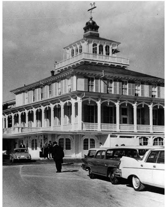
The Pimlico Members' Clubhouse circa 1959.