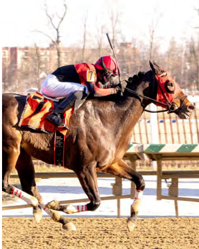
Eastern Bay scored his first graded triumph in the 2023 General George.

The race was first Graded in 1991 and now joins the Barbara Fritchie (G3) to complete the Winter SprintFest, which has become the highlight of Laurel Park's winter meet.