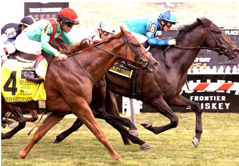
Never Explain winning the 2023 Dinner Party.