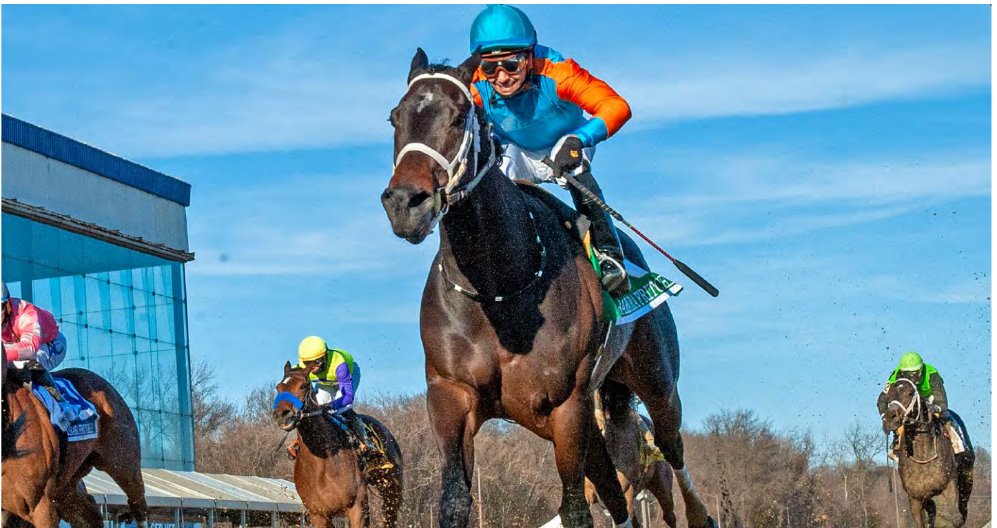
Swayin to and Fro upset the 2023 Barbara Fritchie by a half-length at odds of 6-1.

Not run in 1960, 1972 & 2006. Distance 1-1/16 miles from 1952-1954; 1 mile in 1961; 6 furlongs from 1957-1959 & 1963. Run at Bowie Race Course prior to 1985. Grade 3 1973-1991; 2019-present; Grade 2 1992-2018. * New track record.