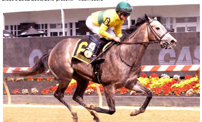
Maple Leaf Mel wins the 2023 Miss Preakness.

Grade 3 2002-2009, 2015-present. *-track record