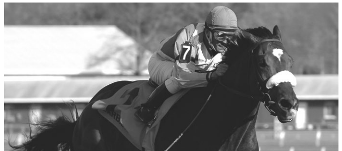
With his victory in the 2006 Kentucky Derby, Barbaro became the 16th Laurel Futurity winner to go on to capture a Triple Crown race at three.

Not run in 1933, 1934, 2001, 2008-2010. Distance 1 mile from 1921-1928; 7-1/2 furlongs in 1994 & 1995; 1-1/8 miles from 1996-2000; 1-1/16 miles from 2002-2007; 5-1/2 furlongs from 2012-2016. Run as Pimlico Futurity prior to 1967; as Pimlico-Laurel Futurity from 1967-1971. Run at Pimlico prior to 1967 and in 1979. Run on the main track 1921-1986, 1989, 1994-2004. Grade I 1973-1988; Grade II 1989; Grade III 1990-2004.