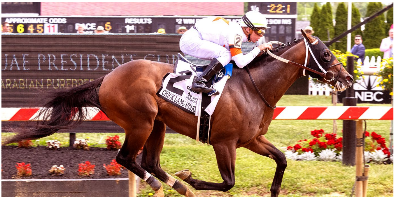
Ryvit winning the 2023 Chick Lang.

Grade 3—2006 to 2010; 2019 to present. Not run in 2005. Run as Hirsch Jacobs Stakes, 1975 to 2009.