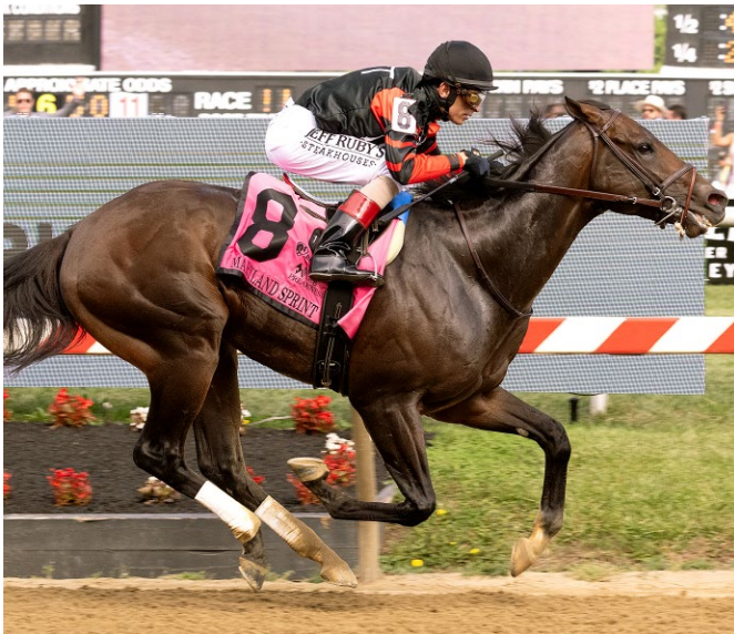
Straight No Chaser winning the 2023 Maryland Sprint Stakes.

Distance 7 furlongs in 1987. Run at Laurel in 1987. First graded in 1994. Run as a handicap prior to 2015. Not run in 2020.