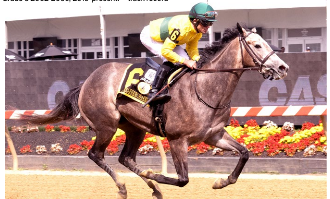
Maple Leaf Mel wins the 2023 Miss Preakness.

Grade 3 2002-2009, 2015-present. *-track record