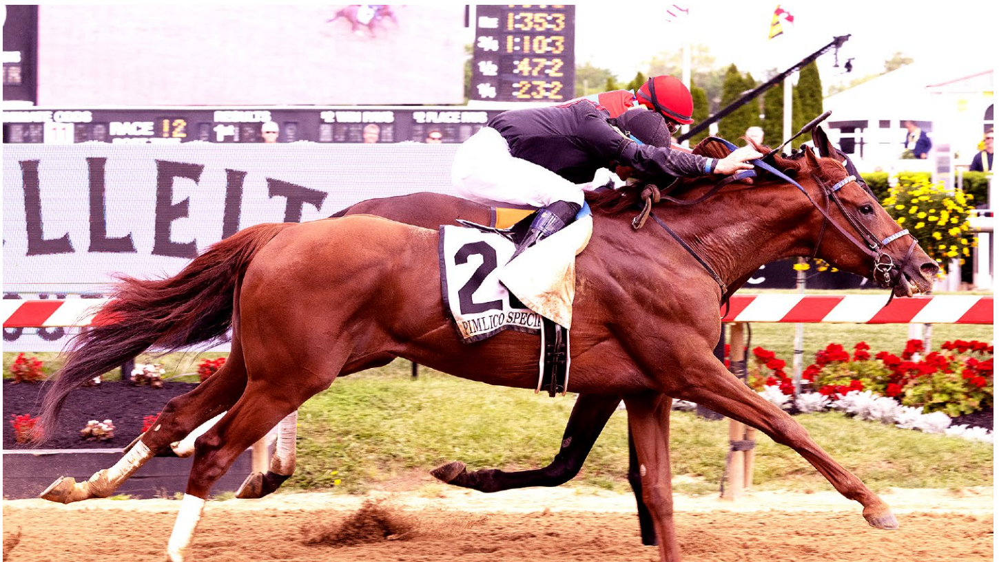
Rattle N Roll winning the 2023 Pimlico Special.

$1 Daily Double (3-2) Paid $12.80; Daily Double Pool $110,826.