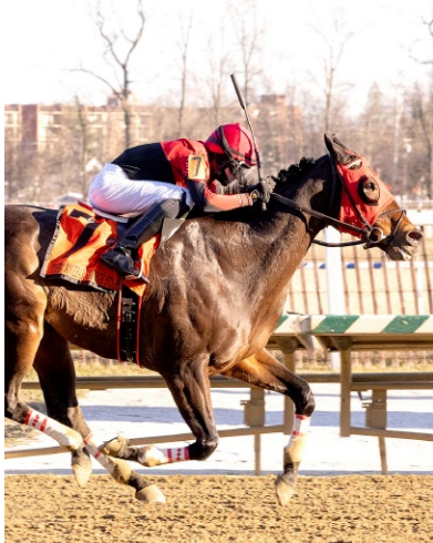
Eastern Bay scored his first graded triumph in the 2023 General George.

The race was first Graded in 1991 and now joins the Barbara Fritchie (G3) to complete the Winter SprintFest, which has become the highlight of Laurel Park's winter meet.