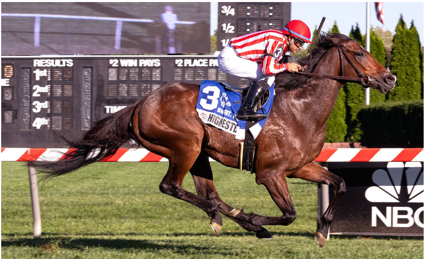
Highestdistinction winning the 2023 Baltimore-Washington International Turf Cup.