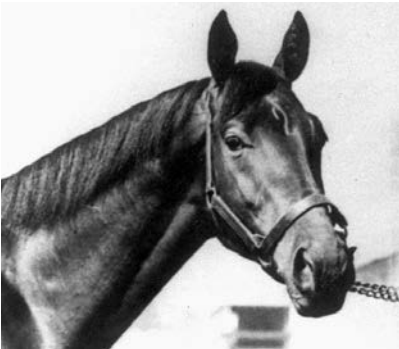
Citation was a supplementary nomination for a fee of $3,000.