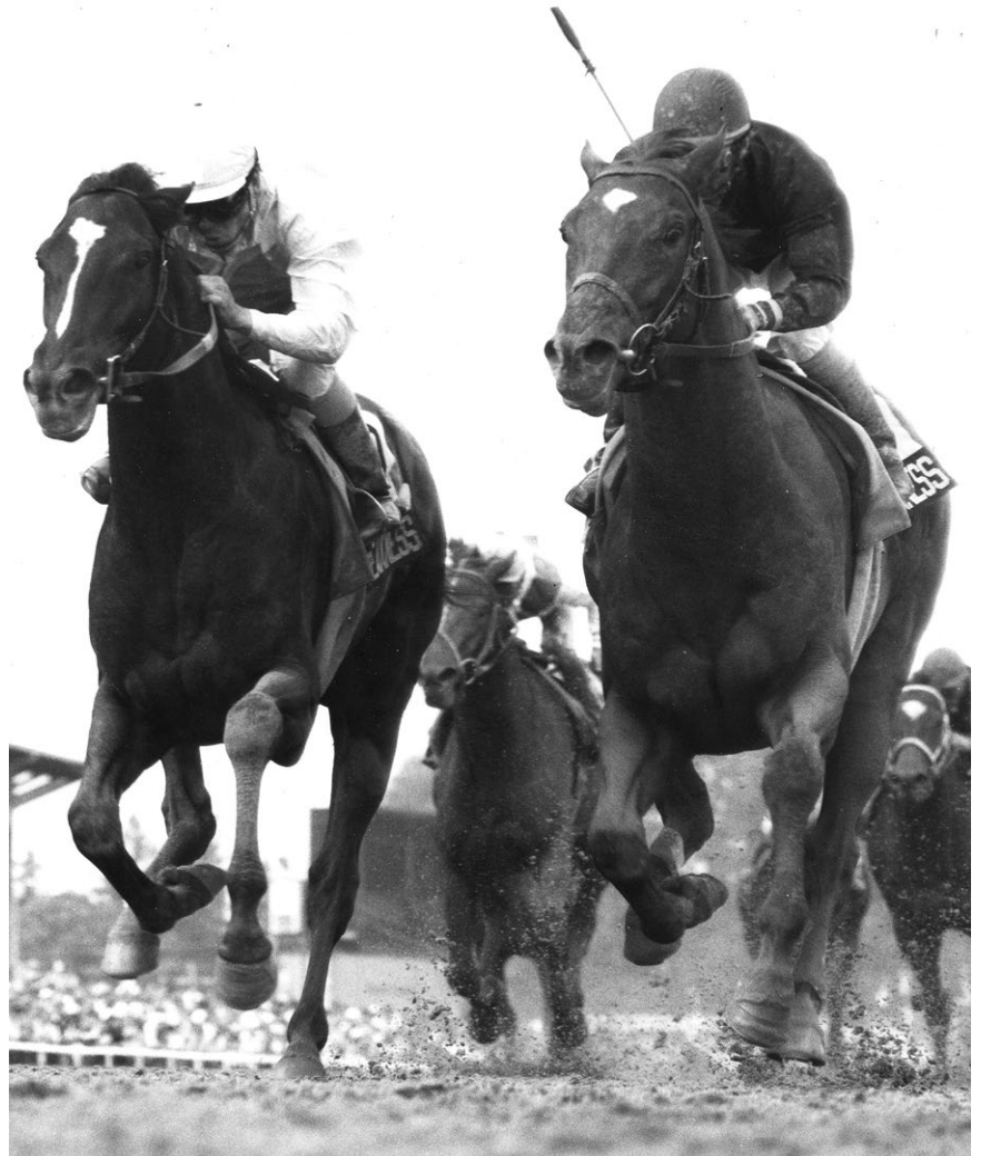
Sunday Silence and Easy Goer hooked up entering the far turn and matched strides to the wire in the 1989 Preakness. Sunday Silence prevailed by a nose in the race that was referred to as the "Race of the Decade" and remains one of the most thrilling Triple Crown victories of all time.