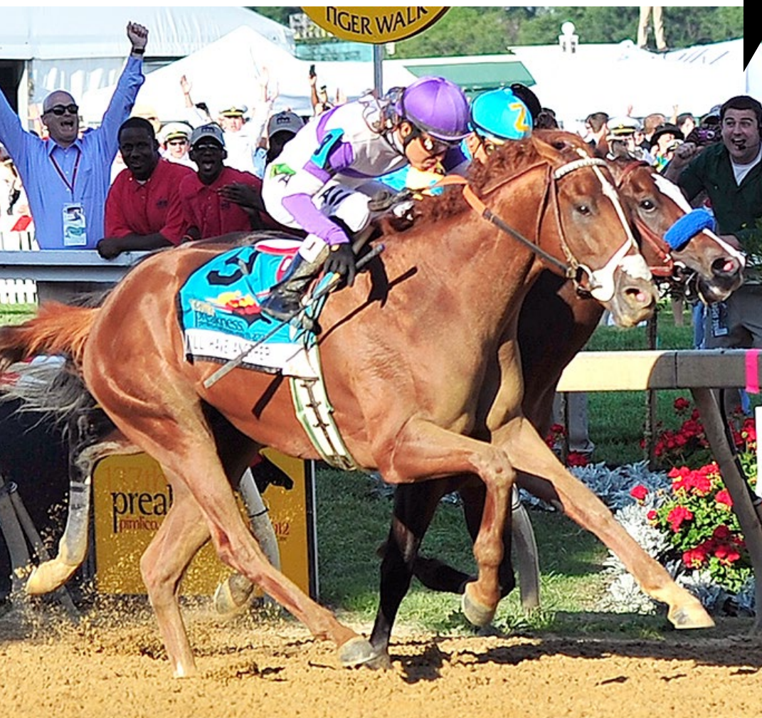
I'll Have Another was the 45th Preakness winner to earn the title of Champion 3-year-old Male.

Swiss Skydiver in 2020 became just the sixth filly to win the Preakness Stakes, beating champion 3-year-old and Horse of the Year Authentic by a neck. Swiss Skydiver would go on to be named 3-year-old filly champion.