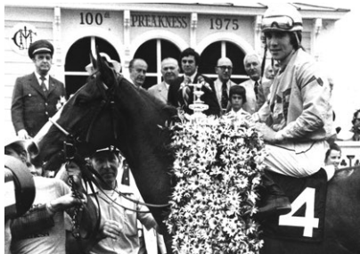
The biggest longshot in Preakness history was Master Derby who paid $48.80 to win in 1975.