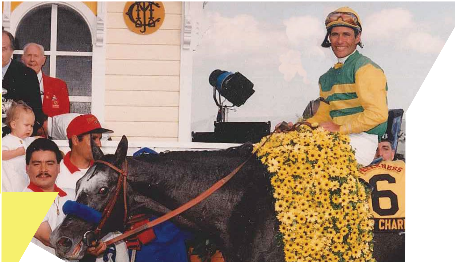
Mike Smith (below right) holds the record for most Preakness starters with 19. Gary Stevens (above) is second with 18 and Pat Day (below left) is third with 17.