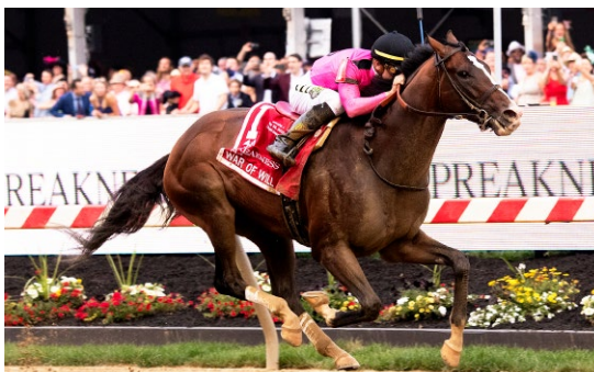
2019 Preakness winner War of Will